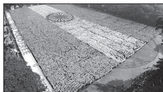
Mass tribute to end Polio.

Eradicating polio from India took impressive coordination and commitment. Rotary members in Chennai, Tamil Nadu, drew on those qualities again in December, when they mobilized more than 40,000 people to create the world's largest human national flag as a tribute to the polio eradication effort.